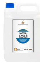
Unperfumed cleaner & sanitiser

Ideal for: Food Preparation, Fridges & Freezers, Shop Fixtures and Shelving.