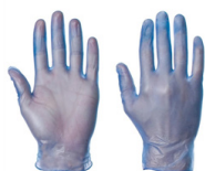
Powder free disposable blue Vinyl gloves