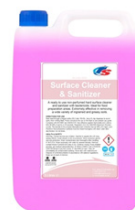
Odourless sanitiser 5L & 750ml

Ideal for: Food Preparation, Fridges & Freezers, Shop Fixtures and Shelving.